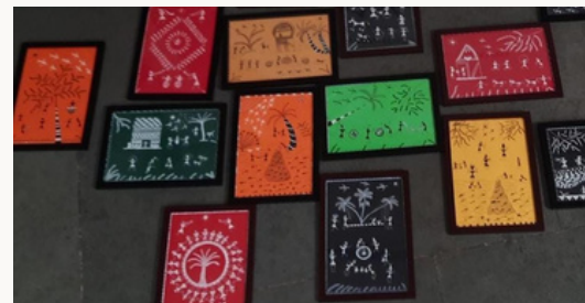
Mandala and Warli Artwork by children